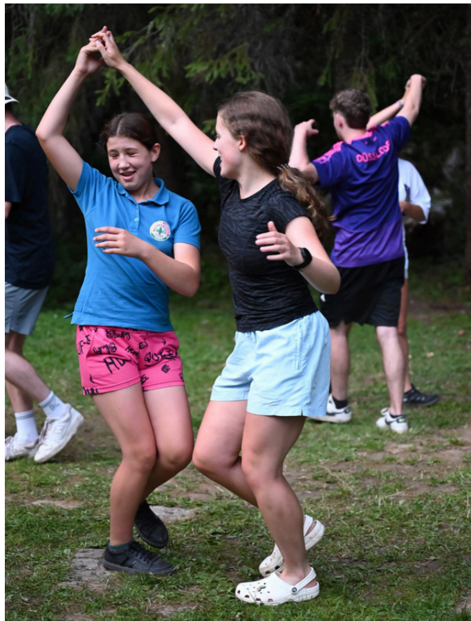
Camp is a time to relax and to learn

Easter is over. Three days changed the world, three days that changed me. They too were planned; the Eternal Son came into the world and at just the right time he died and rose again. A gift for camps from you today can change young lives for good. Pray it may be part of a bigger plan to change a life forever.